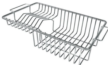
Stainless steel plate rack 8100 305