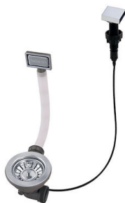
Automatic waste fitting - PM 8407 113