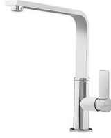
Mixer Tap NYC 8486 000